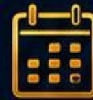
EXHIBIT HALL SCHEDULE